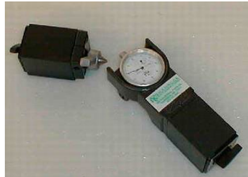
Figure 2 - Magnetic base tie bar strain gage.

cracked. Two popular methods of measuring tie bar "strain" are shown in figures 2 and 3.