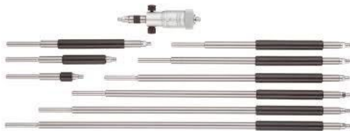
Figure 1 - Inside micrometer example.

First I need to clarify some terms. The above terms are often used interchangeably but are not necessarily synonymous. In addition, the assumption is that the linkage, platens and tie bars are in good physical condition. For the moment let's assume the above mechanical components are in good condition. Next the die "i.e. the load" should be equally parallel and centered in the platens. At this point the corner to corner parallelism of the platens should be within a few thousandths say, 0.005 to 0.020 in. (0.127 to 0.508 mm). Measuring parallelism is accomplished by measuring between the 4 outside corners of the moving to fixed platens with an "inside" micrometer.